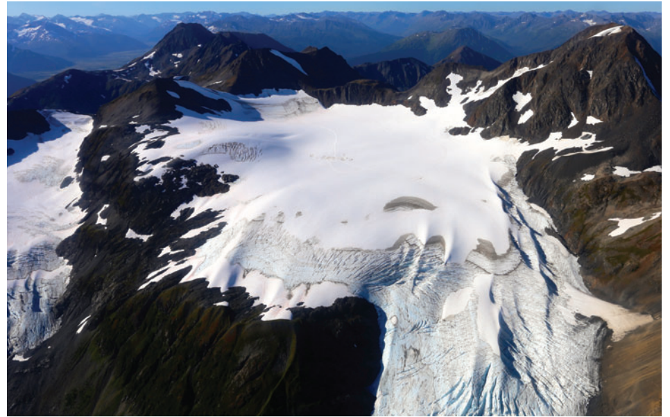
Marc Donadieu / Glacier City Gazette

"It's funny, Girdwood from what it was back in the 80's to what it is now is almost unrecognizable from the amount of growth in the town. Our business has kept pace with the growth of the town. As the town has grown, we have grown."