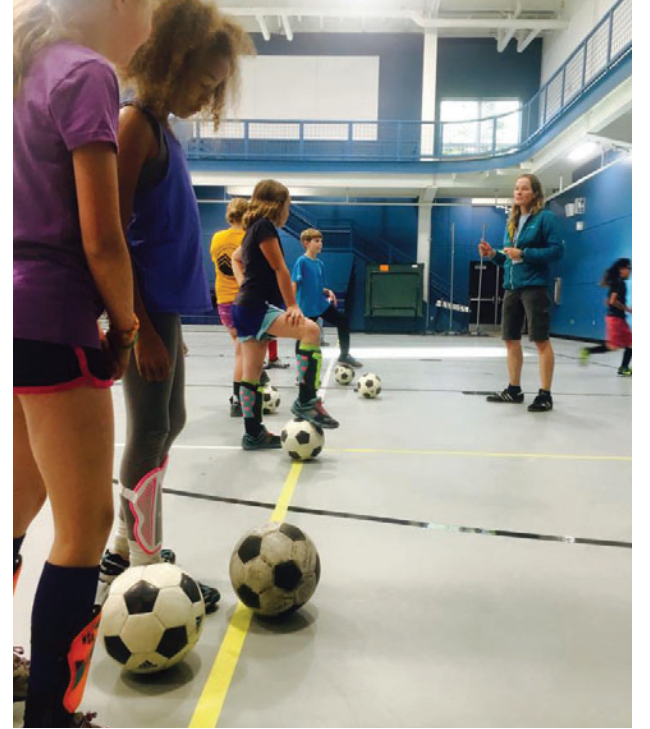
Soccer began last week with over 60 registered kids for the six week program. Thank you to all the volunteer coaches, who make this program possible.

and be involved. We are proud to have Girdwood, Bird, Indian and Portage in our DNA.