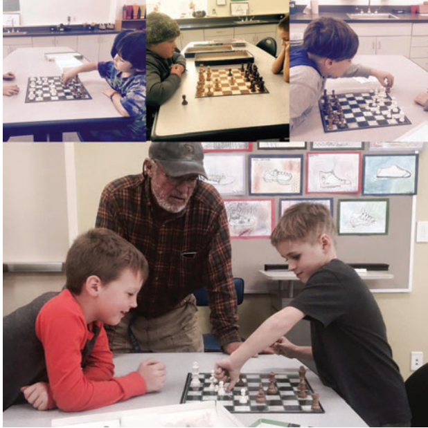
Chess club began Oct. 5 and continues Wednesdays through Dec. 7 right after school.

This quote is from the first edition of "The Local News" in January 1981; the very first days of the Four Valleys Community School. FVCS was publisher of "The Local News" from 1981-2000. Thirty five years later, we are still here and stronger than ever. Today we are the only community school left in Alaska. If you're a part of this community, you're a part of FVCS. We may be small, but we are mighty, and most important, we are