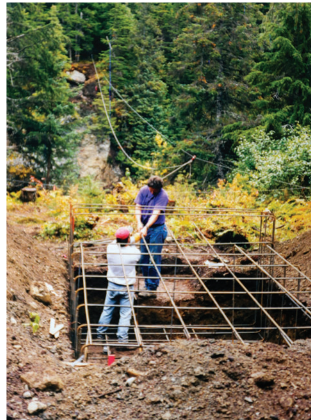
The rebar gets set up in anticipation of cement to form the hand tram's base on the Crow Creek side.

After a Trails Committee meeting decided a bridge across Glacier Creek at that location would be futile, the idea of building a hand tram across the top was raised as an alternative to connect trails throughout Girdwood Valley. In 1995, Yeager was given permission to write a grant for Gov. Tony Knowles' program called Track, a grant program for trails